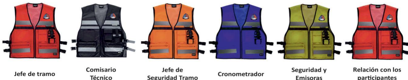
Jefe de tramo